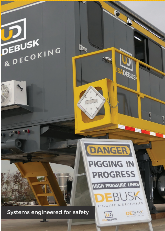
Systems engineered for safety