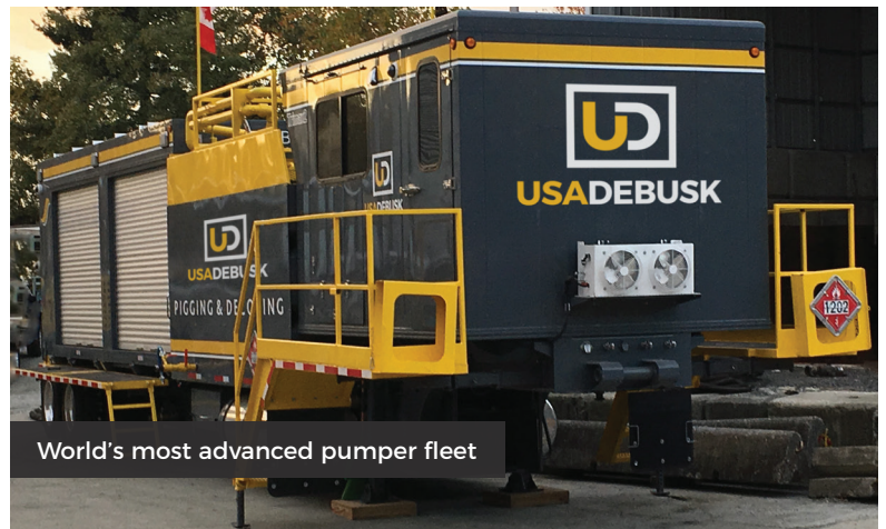
World's most advanced pumper fleet

USA DeBusk provides comprehensive planning and execution, including project design, engineering, scheduling, cost savings analyses and verifiable results for all services.